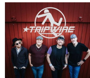
Rock out to Tripwire, one of four bands hired to end each night with a bang!

Make plans now to attend our biggest summer fundraising event at American Legion Post 21 in Moorhead, MN July 25-26, 2025. We can't wait to have a blast with all of you!