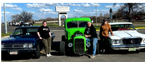
Check out the classic cars and hot rods at Cruise Night

Greet community heroes in person as they arrive home from Washington, DC