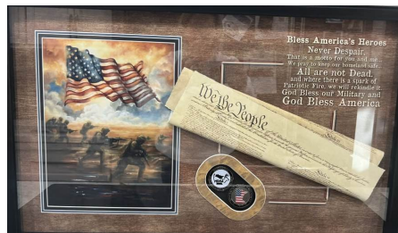
One of the many beautiful items up for bid