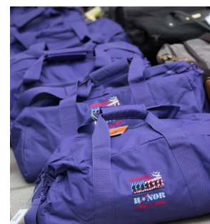
Give your luggage visibility by adding a unique tag or ribbon

Nothing kills the buzz of a great travel day like trying to find your correct luggage.