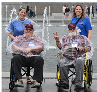
A little rain isn't going to stop us! We'll be ready to keep you dry if need be.

the skies open up, warm blankets in case of a cold snap, sunscreen to prevent against the harmful effects of a cloudless sky, tons of bottled water to keep everyone hydrated during