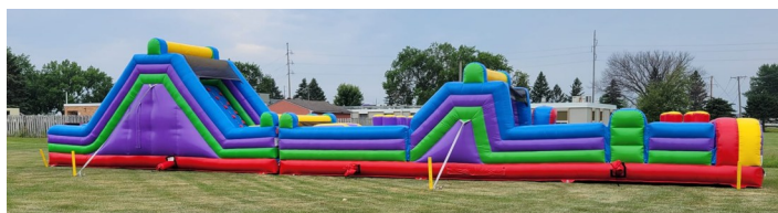
Let the kids jump their energy out on a bouncy house similar to last year's version

been booked to close out each night's events. Friday evening features two groups for the rock 'n rollers when we party to Tripwire and an REO Speedwagon tribute band, while Saturday night brings out the country in everyone with tributes to both Alabama and Toby Keith — yee-haw! No matter your style of music, both evenings always bring